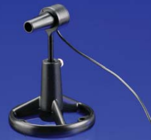
MODELS LM-2 / OP-2

Semiconductor sensors have very high sensitivity and are ideal for CW laser measurement at the nW to mW power level. These sensors typically saturate in the 10-50 mW range, so for linear operation up to a maximum of 5 watts, a 1000:1 optical attenuator should be used (see page 87).